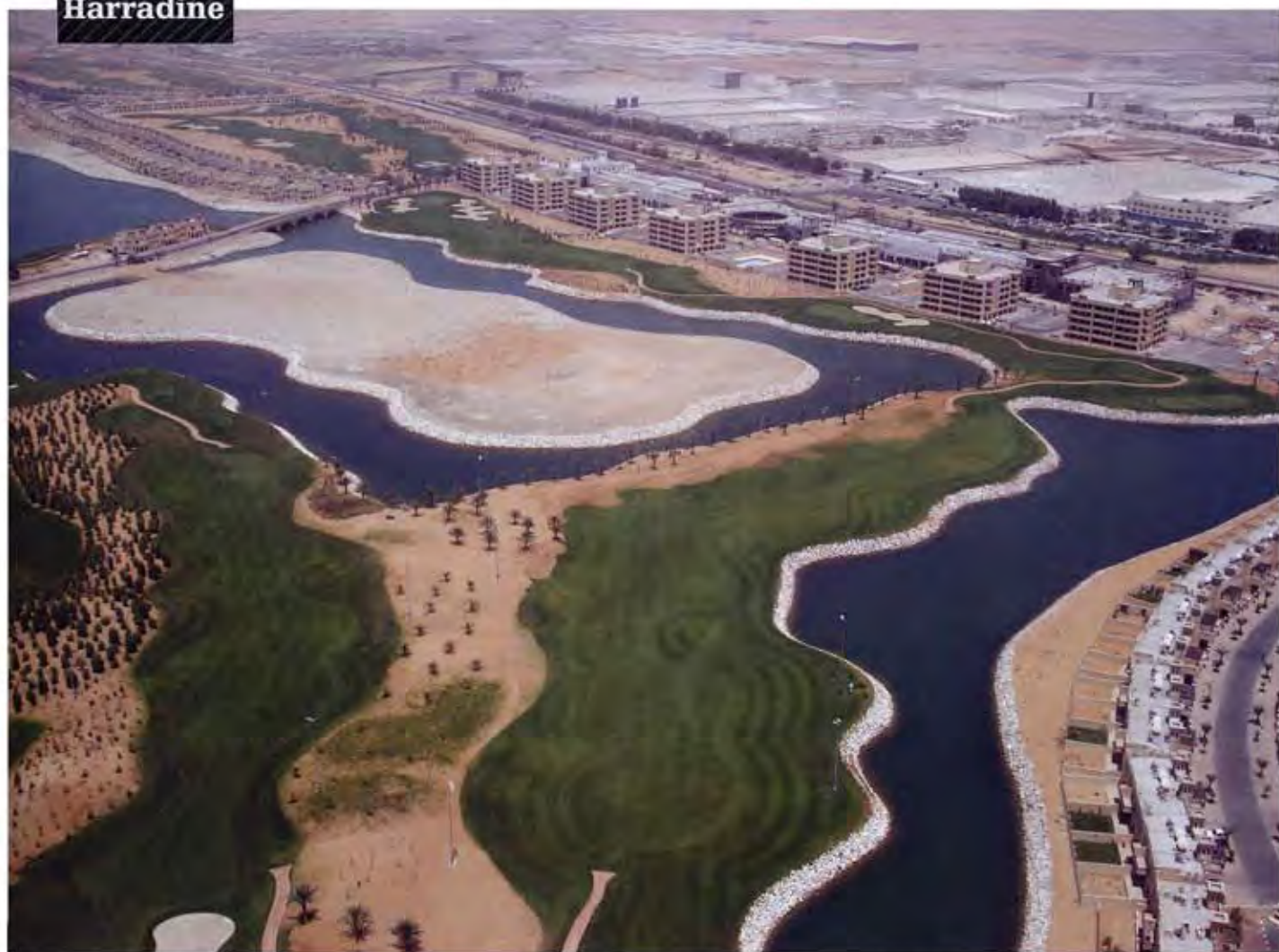
Aerial views of the Al Hamra Golf Course at Ras Al Khaimah, plus the floodlit section at night – another course close to completion by Harradine Golf.

these days. The bigger the name, the better the golf course, is the expectation. Almost every leading player is now trying to get into the design business. It used to be the case that when great players put their clubs in the attic they'd turn to the design business. Nowadays even current players call themselves designers.