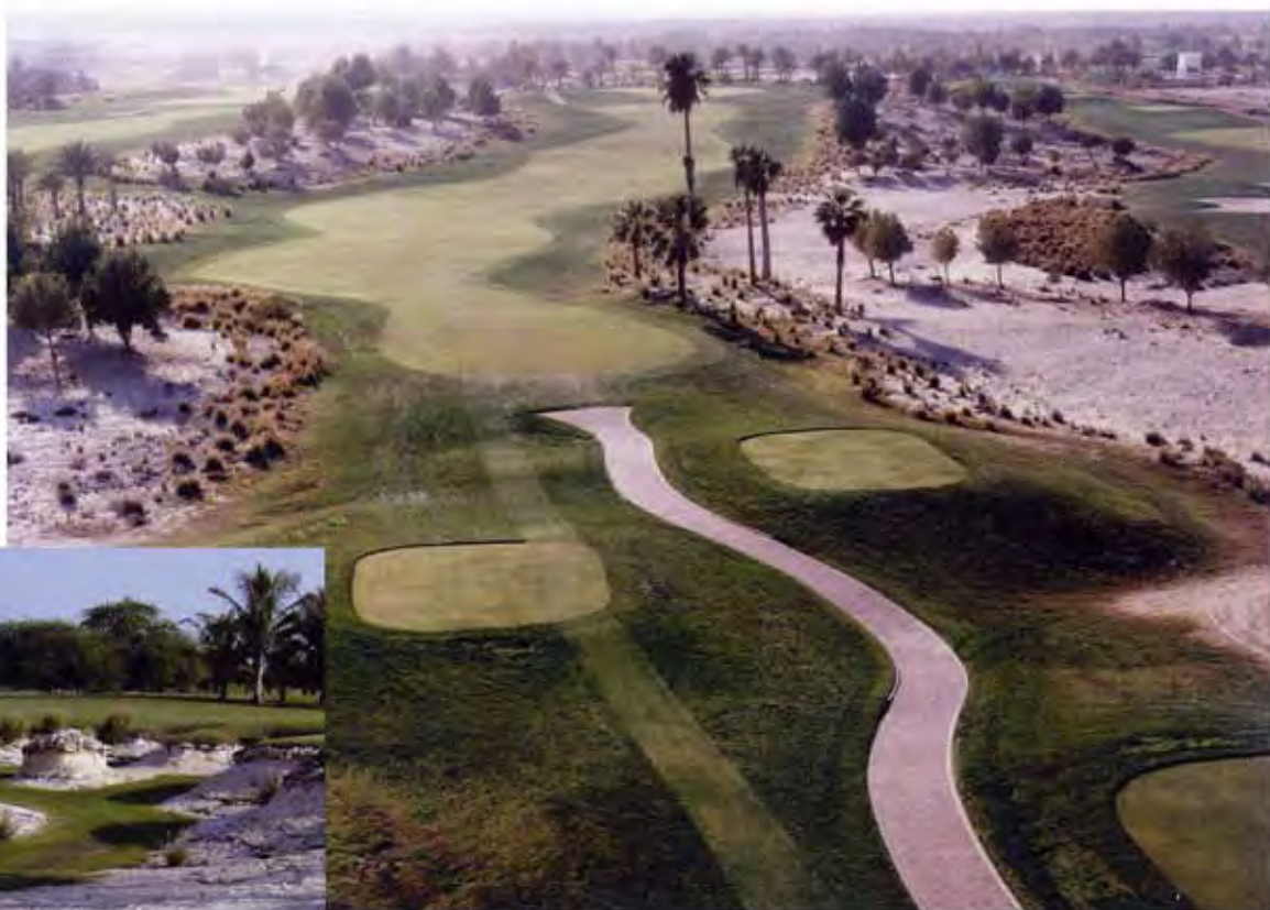
The universally acclaimed Doha Golf Club, which hosts the prestigious Commercialbank Qatar Masters on The European Tour, completed by Harradine Golf in 1998.