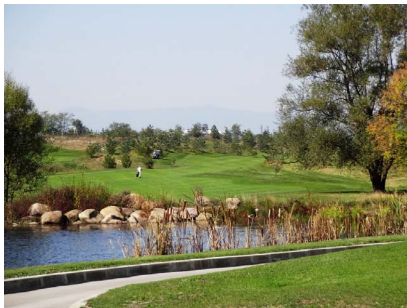
View from the yellow tee on the 11th hole