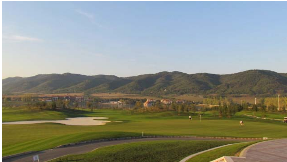
View from the terrace towards the double green 9 and 18th