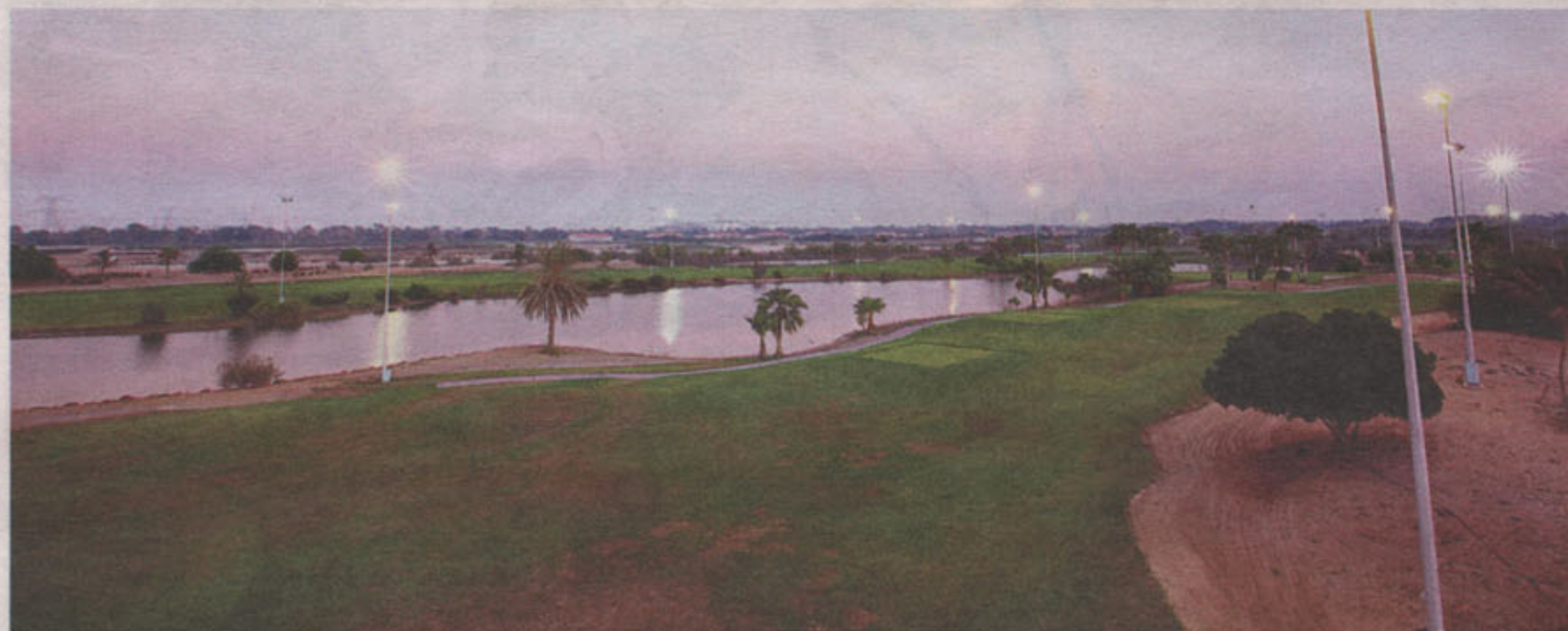
Tee time: You can make use of the facilities till 10pm, making it a perfect after-work activity.