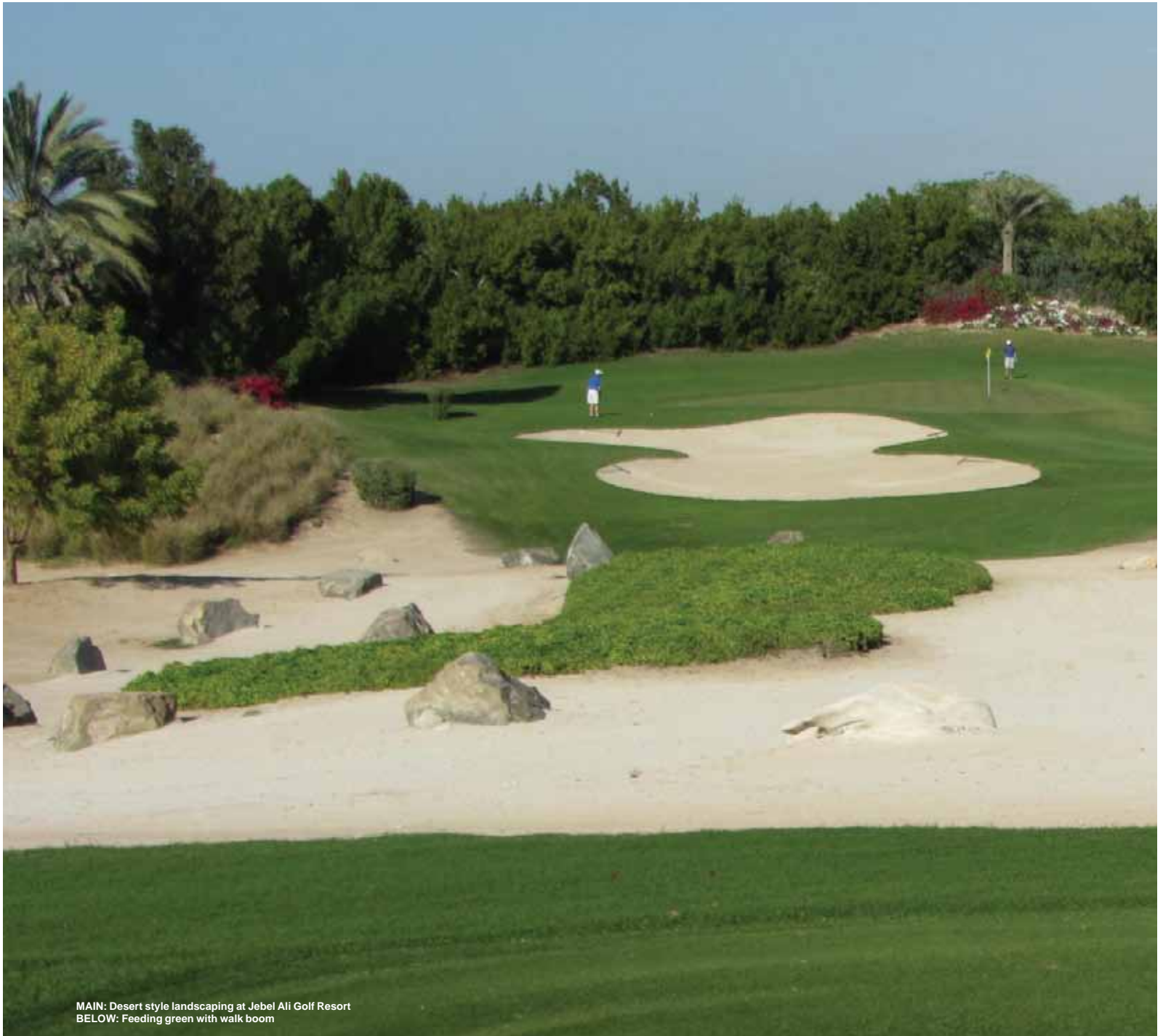
MAIN: Desert style landscaping at Jebel Ali Golf Resort BELOW: Feeding green with walk boom