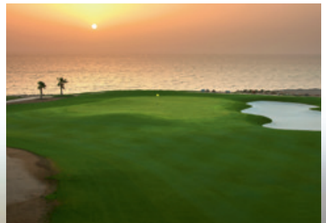
Jebel Sifah sits on the shores of the Gulf of Oman